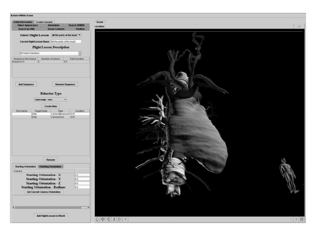
Figure 3. User Interface. Adding animation to a prosaic scene (this scene depicts the mediastinum)

mediastinum. The anatomist then opts to make this scene expressive by authoring an lesson within the animation module (Fig. 3). This module contains a table that will be filled with sequences of actions in the new animation. The author creates a new sequence, adding to it several camera movements and turns, followed by sequential highlighting of various structures in the mediastinum. The author may add several audio voice-overs to serve as narration for the lesson which will play in parallel with the highlighting of the structures. The animation is reviewed, edited as needed, and then the entire scene, and its animations, is saved as a VRML file. This self-contained VRML file is subsequently made available to students via a web server.