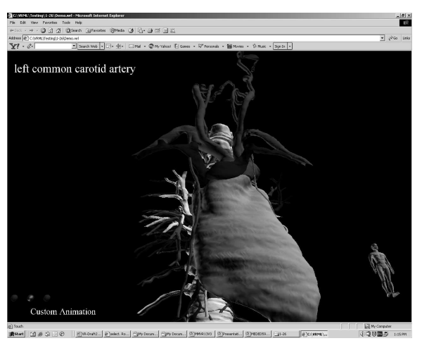
Figure 4. Output. Typical .wrl file viewed by a student, complete with HUD controls

Leveraging 2D and 3D capabilities together. Although "a picture is worth a thousand words", there are some functions that require the pragmatic simplicity of 2D displays. For example, querying the FMA by selecting "parts of" and typing "heart" is considerably more efficient than using a visual control to achieve the same end. Therefore, the functionalities of both 2D text-based modules and 3D visualization are combined in Biolucida to maximize its flexibility. Other developers may extend Biolucida's functionality or to provide some type of external analytical functions by extending these 2D panel objects.