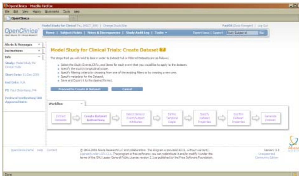
Export Data Screen, OpenClinica™ Application Accessed January 5, 2010

Shown below is a sample screen from OpenClinica™ version 3.0.1: